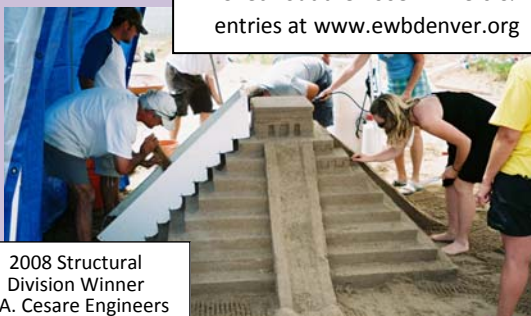
2008 Structural Division Winner J. A. Cesare Engineers

Check out the 2008 winners & entries at www.ewbdenver.org